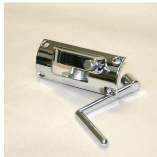
Plated Steel Hardware