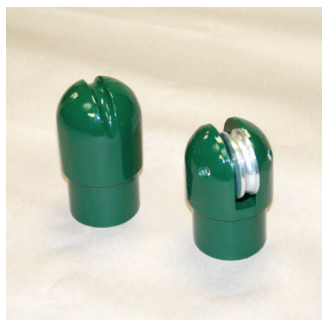
Cast Aluminum Alloy Caps