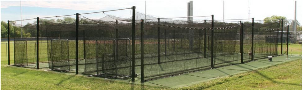
Douglas® Triple Batting Tunnel Frame 55'/70'/75' (Item # 66214T)